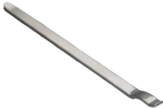
Tyre lever Wave, specially designed for low-profile tyres and run-flat tyres such as DSSST, RFT, but not for PAX or CSR. Standard on monty 3300 racing/GP and monty 3550/GP.