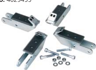
+4" clamping jaws to increase outer clamping range for monty 3300/GP, 3300-24 2-speed/GP und 3550/GP