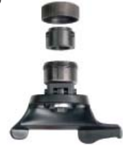
Quick-exchange device including plastic mounting head for rims with elevated spokes