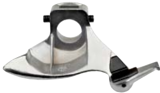
Mounting head for rims with elevated spokes