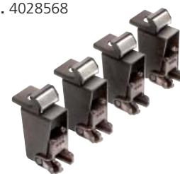
Motorcycle adaptors for monty 3300-24 2-speed/GP, 3300 racing/GP and 3550/GP