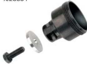
Mounting head adaptor