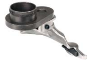
+4" quick-exchange device including steel mounting head for monty 3300-24 2-speed/GP, 3300 racing/GP and 3550/GP