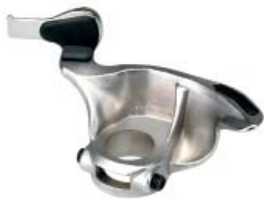
Mounting head for motorcycle wheels