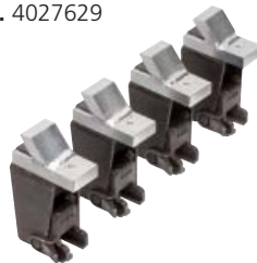
Light-truck adaptors 17,5" for monty 3300-24 2-speed/GP, 3300 racing/GP and 3550/GP